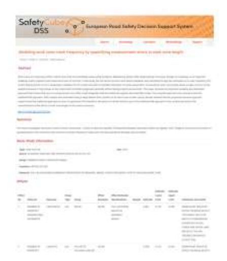
Table listing the detailed effects reported in the study

Proposal for the Sponsor - SafetyCube Cooperation, April 2018